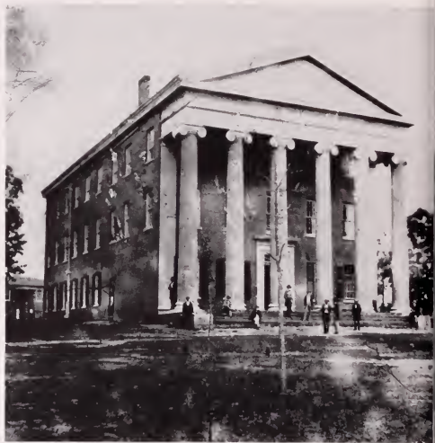
The Lyceum Building in 1860