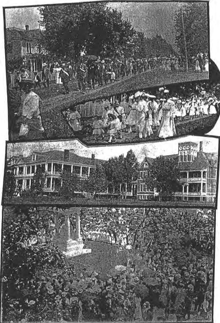
DEDICATION OF CONFEDERATE MONUMENT, HIGGINSVILLE, MO.

1. Procession of Veterans. 2. Procession of Children. 3. Confederate Home. 4. Gathering at Dedication of Monument.