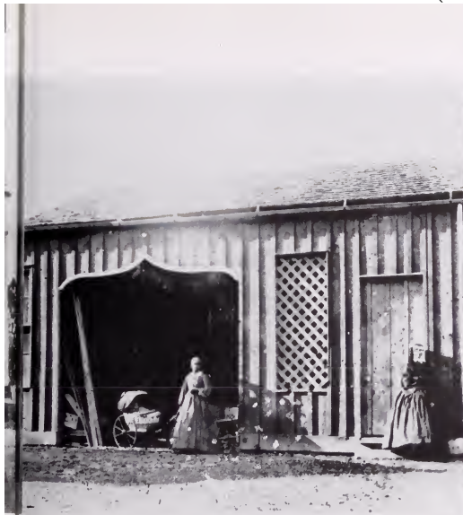
A carriage-house in use at the University in 1860 The people are unidentified