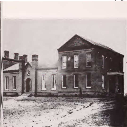
Taylor Hall in 1870. In this building was housed the University preparatory school