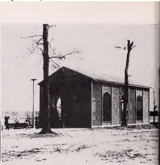
The University Gymnasium in 1860