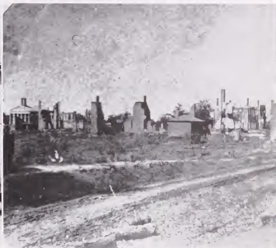
Oxford Square. A rare picture showing the desolation and ruin left by the Union forces